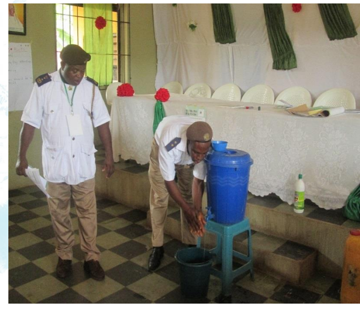
Demonstration of hand-washing during a training for women in Delta State, Nigeria.